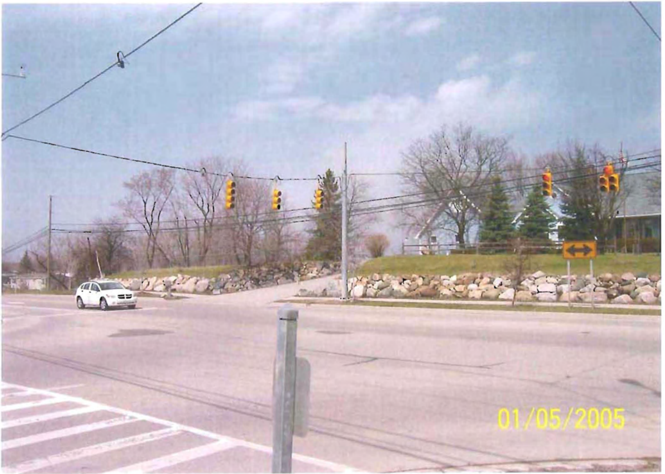
BOXSPAN CONFIGURATION AT 13 MILE + MEADOW BROOK