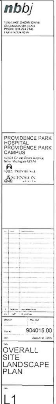
EARLY PLAN OF PROVIDENCE PARK SHOWING GREENSWARD