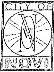
EXHIBIT A FEE PROPOSAL CITY OF NOVI