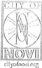
EXHIBIT A FEE PROPOSAL CITY OF NOVI