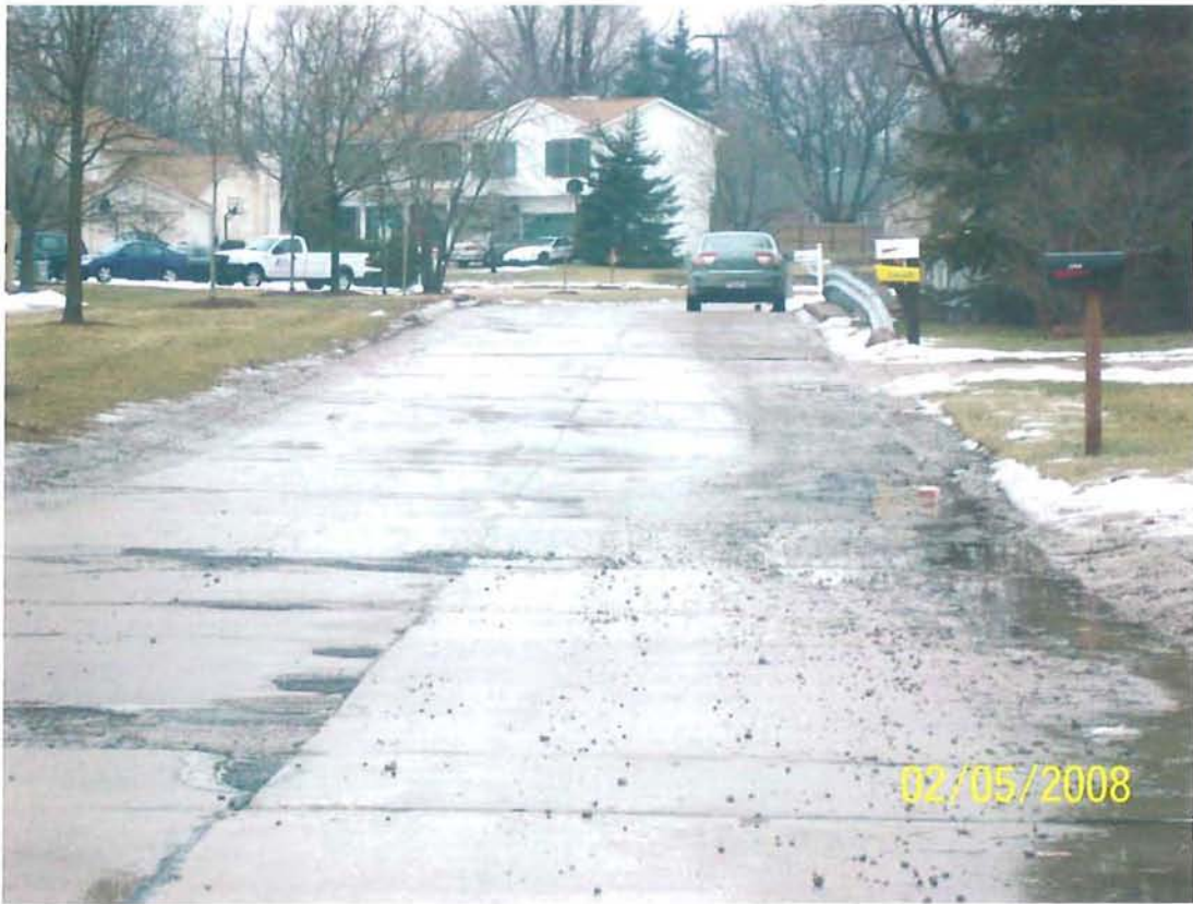
Northbound Cranbrooke Drive at Valley Starr (Pre-Construction)