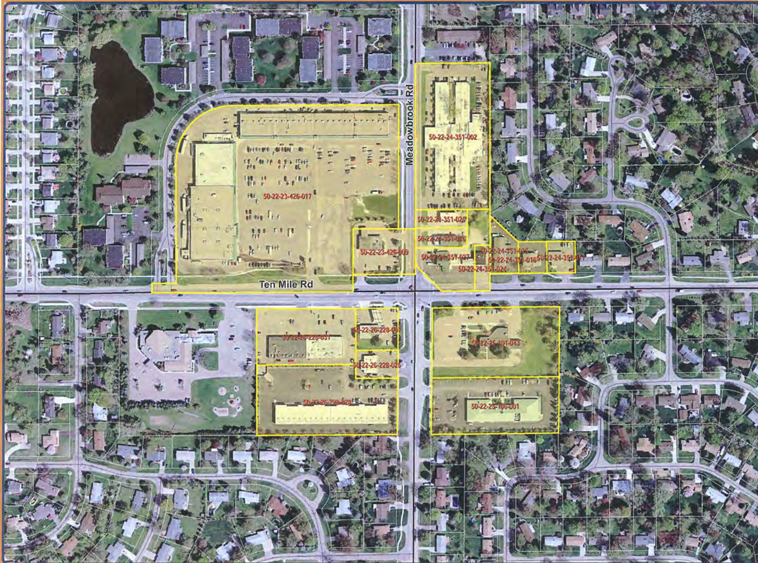
Figure 2-1. Ten Mile and Meadowbrook Commercial Rehabilitation Area Parcels Included within Commercial Rehabilitation Area