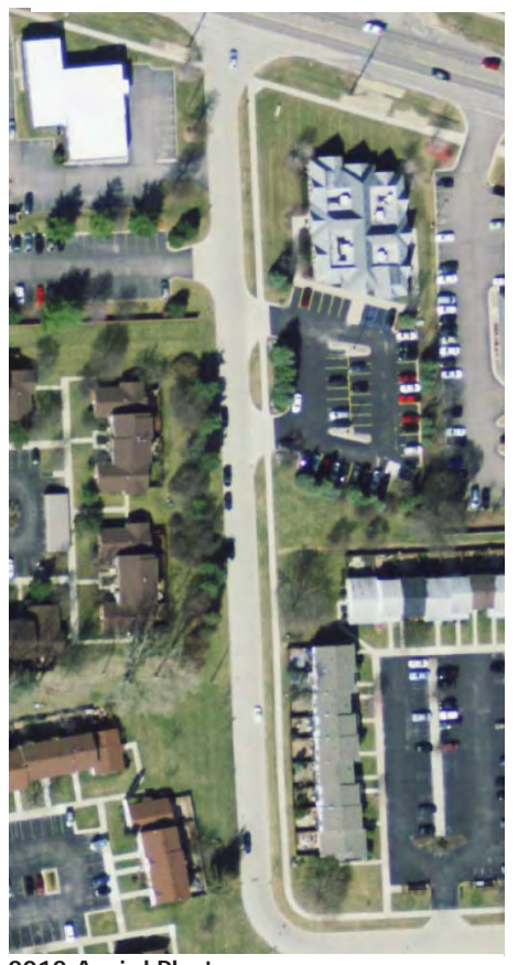
2012 Aerial Photo