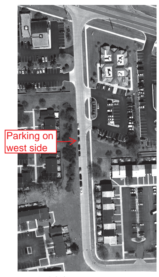
2006 Aerial Photo