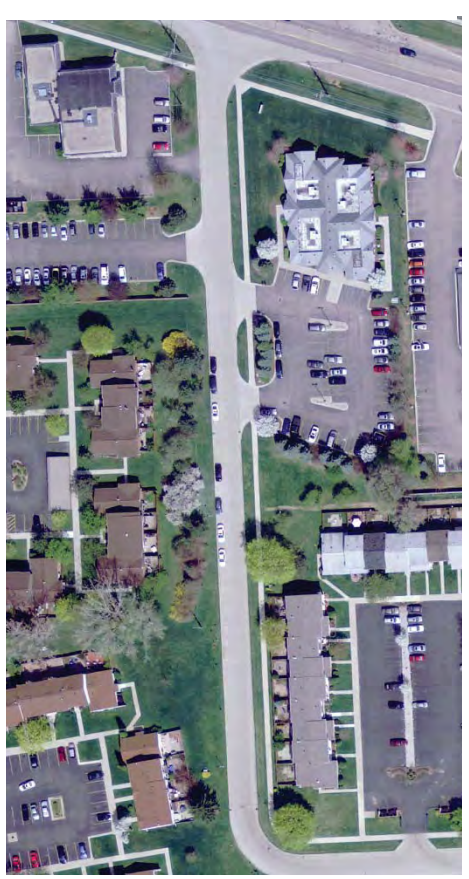
2010 Aerial Photo