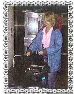
A Homebound Meal Delivery Driver preparing for the day.