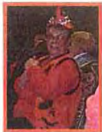
Enjoying the tricks and treats!