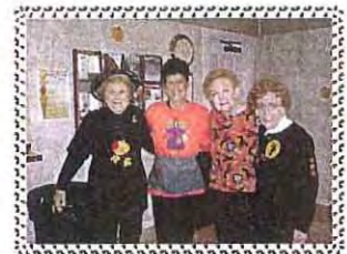
The kitchen servers / volunteers work hard but also get into the spirit.