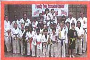
FSDC Tournament Participants

coming tournaments planned for October 2010.