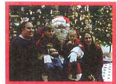
Santa and Mrs. Claus were available for pictures and listen to good boys and girls holiday wish lists!

Indoors, children were able to get creative by making holiday themed crafts. Participants were able to complete some holiday shopping at the craft show, and Holiday snowmen decorated by Novi Schools were on display for the this year's event!