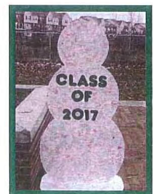
Novi Meadows 5th graders signed the "Class of 2017" snowcreature.