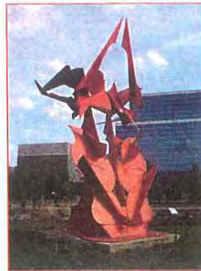
Dearborn Outdoor Sculpture Exhibit

Midwest Sculpture Initiative is currently exhibiting in 10 shows throughout Michigan and Ohio including Canton Township and the University of Toledo.