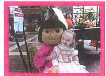
Pirates, princess and plenty of trick or treating!

Trick-or-Treater's played with storybook characters and filled their treat bags with lots of goodies! Storybook characters enchanted children young and old. The Storybook Stroll also featured Peter Pan's corner which was described as a fun-tastic fantasy.