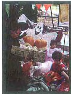
Witch's storytime was a spooky success!

The third annual Novi Halloween Storybook Stroll, sponsored by Busch's Market, Kindercare, Novi Oaks Dental, Sweet & Sassy, Carnival Cuts, Little Friends Preschool , took place on Saturday, October 24, 2009 in the Novi Civic Center. Families enjoyed collecting treats from storybook characters, arts and crafts, games, a bouncer, cider, hot chocolate and donuts.