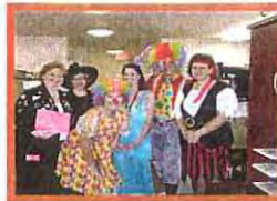
The staff get into the act too! A perfect time to see their true identity.

prizes. 83 people participated in this fun-filled day!