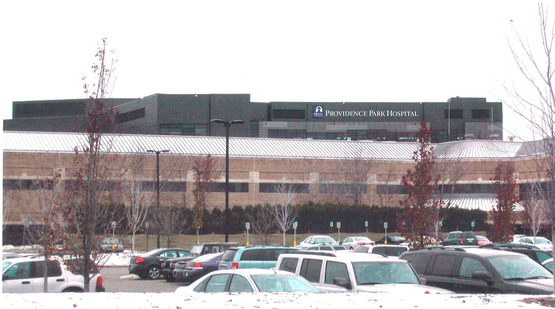
ONE (1) INTERNALLY ILLUMINATED LOGO AND LOGO LETTERS

SIGN graphix 39255 Country Club Drive, Suite B-35, Farmington Hills, Michigan 48331-3490 Ph. 248-848-1700 Fax 248-848-1722 www.signgraphix.net