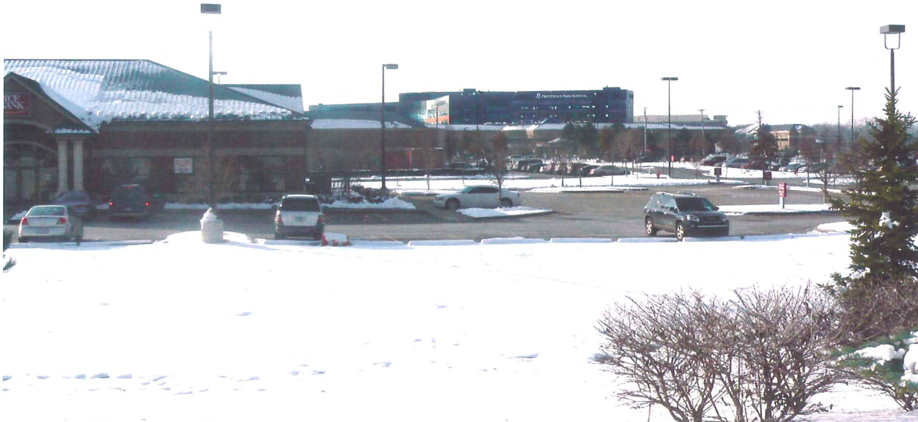
ONE (1) INTERNALLY ILLUMINATED LOGO AND LOGO LETTERS

SIGN graphix 39255 Country Club Drive, Suite B-35, Farmington Hills, Michigan 48331-3490 Ph. 248-848-1700 Fax 248-848-1722 www.signgraphix.net