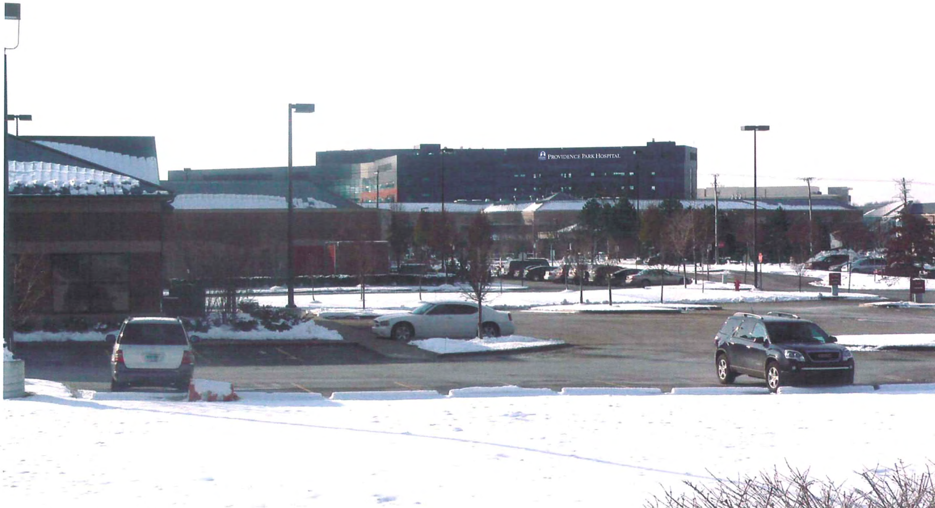
ONE (1) INTERNALLY ILLUMINATED LOGO AND LOGO LETTERS

SIGN graphix 39255 Country Club Drive, Suite B-35, Farmington Hills, Michigan 48331-3490 Ph. 248-848-1700 Fax 248-848-1722 www.signgraphix.net