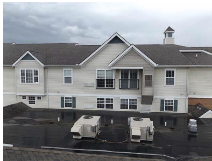
Figure 2 Alternate View of 2 of 3 Units on the flat roof of the Activity Center