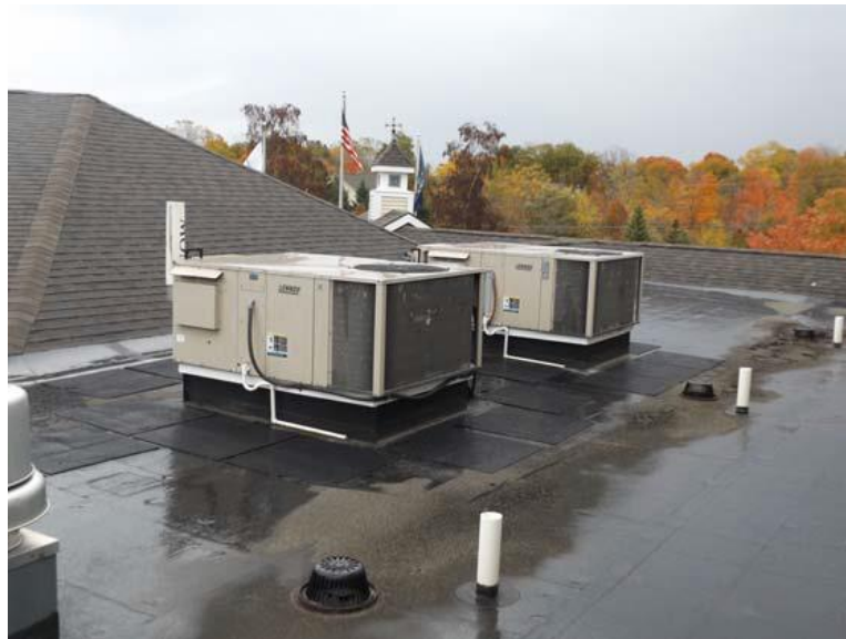
Figure 1 View of 2 of the 3 Units

RECOMMENDED ACTION: Approval to award replacement of three (3) heating and cooling rooftop units at Meadowbrook Commons under the existing City contract with RW Mead & Sons in the amount of $48,550.