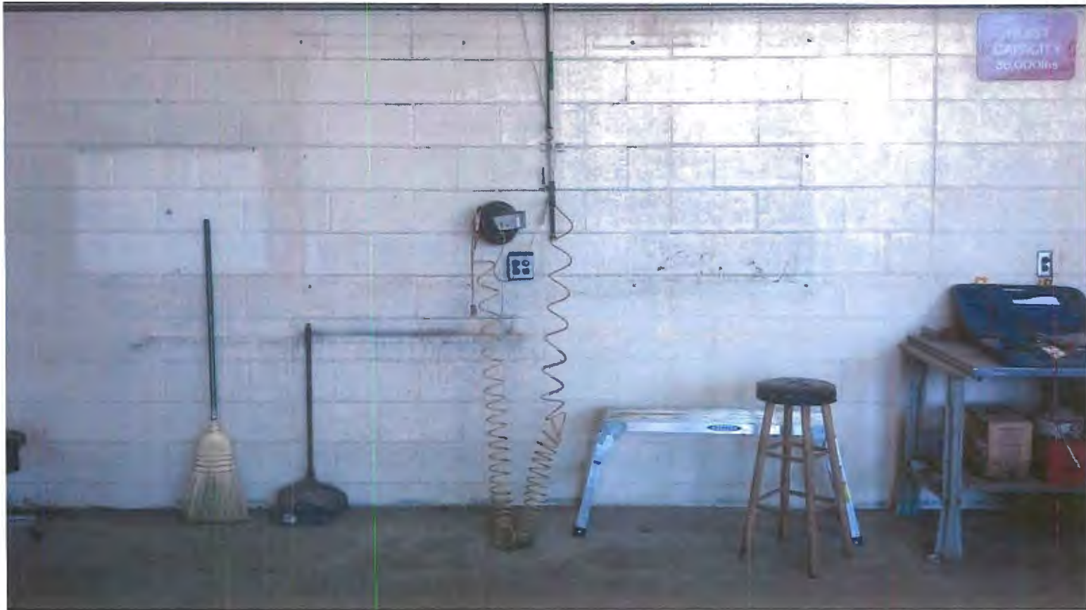
Wall in maintenance bay showing typical existing conditions.