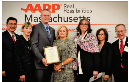
Commonwealth of Massachusetts

See the complete list of enrolled communities: AARP.org/AgeFriendly-Member-List