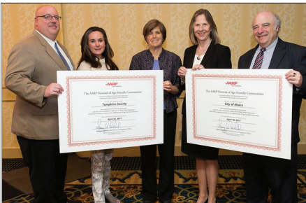
Ithaca and Tompkins County, New York