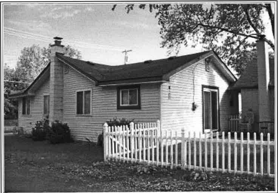
REAR VIEW OF SUBJECT PROPERTY

Appraised Date: October 3, 2011 Appraised Value: $ 60,000