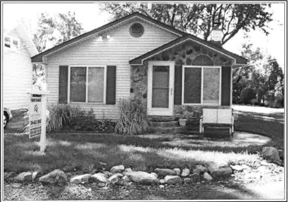
FRONT VIEW OF SUBJECT PROPERTY

Appraised Date: October 3, 2011 Appraised Value: $ 60,000