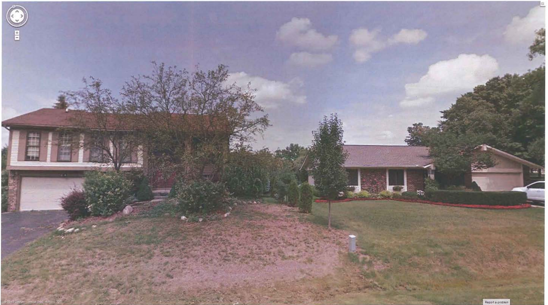
Access to Structure #3