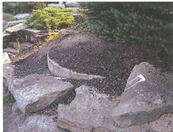
Structure surrounded by Landscaping

Each of the located structures were mapped using GPS and are shown on the included map. One structure (Inlet #1) was not able to be located; however, DPS staff provided us with an approximate location (east end of Village Oaks Lake). The individual structures were difficult to locate due to the landscaping, steep terrain, and improvements installed by the homeowners.