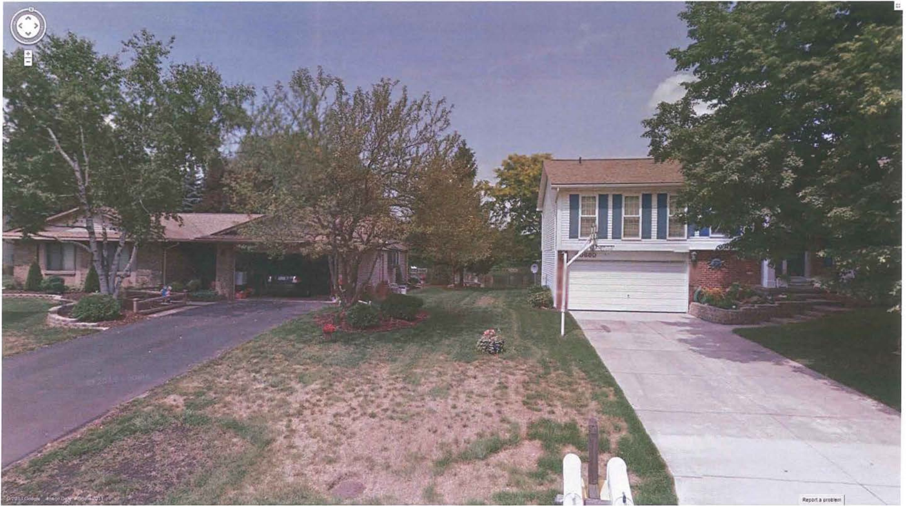
Access to Structure #6