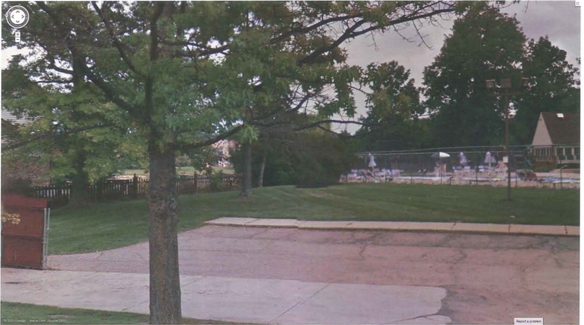
Access to Structure #8