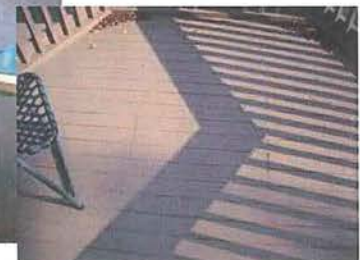
Access hatch in deck