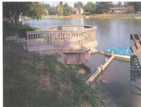
Deck built over Structure

Structures were located in difficult to access areas, such as under large pine trees and, in one case, under a deck / overlook. Some inlet pipe end-sections were submerged, and therefore were not visible for observation.