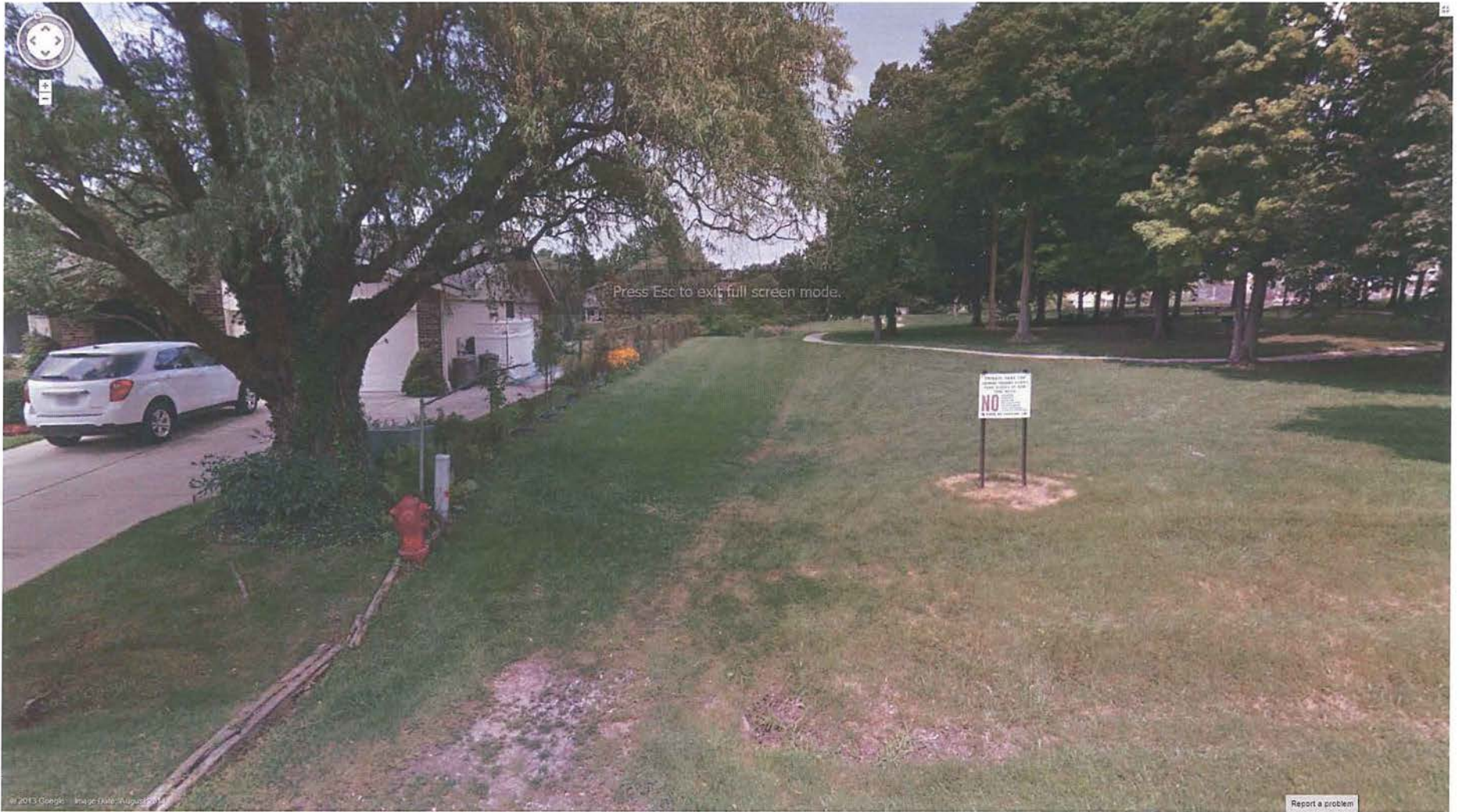
Access to Structure #2