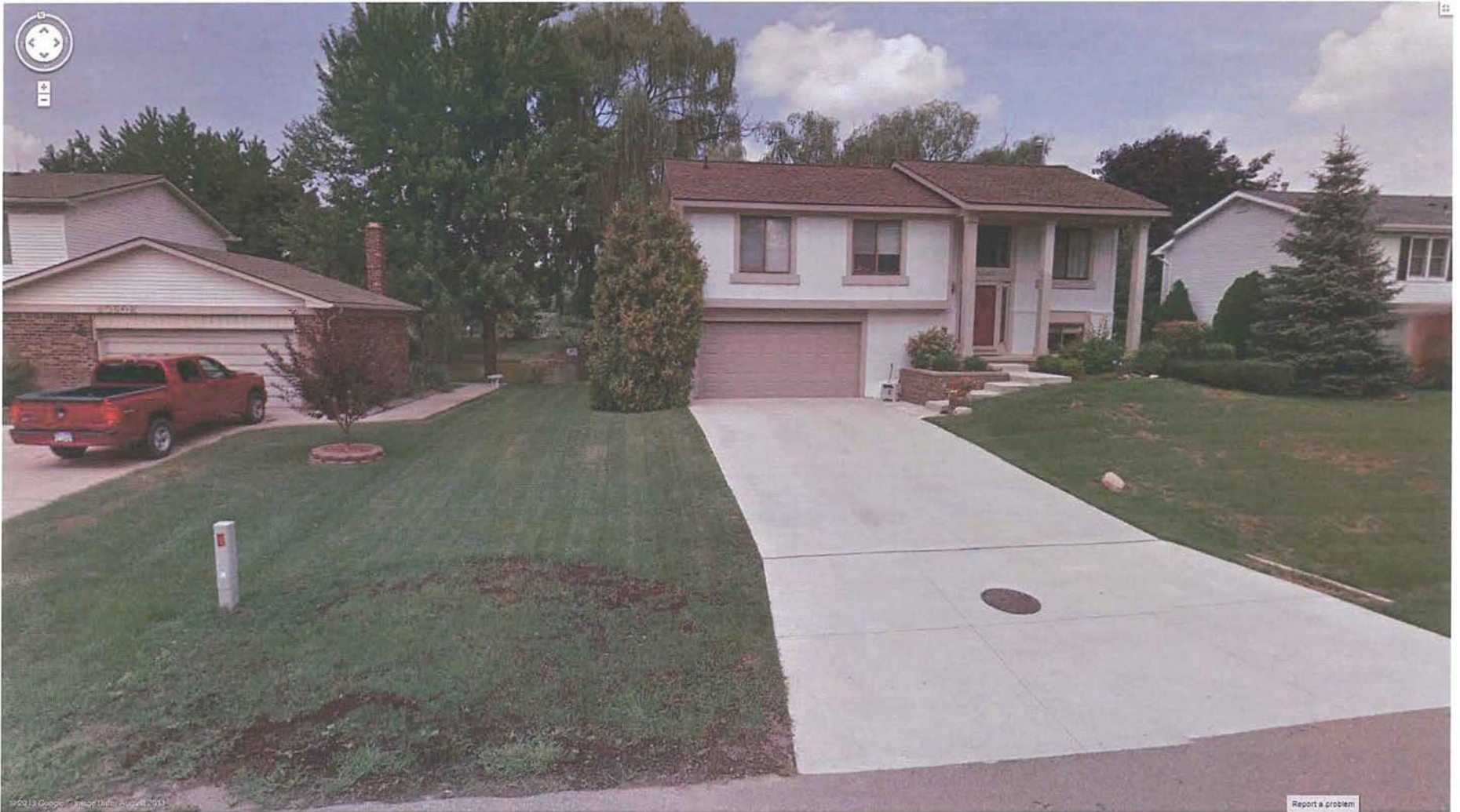
Access to Structure #4