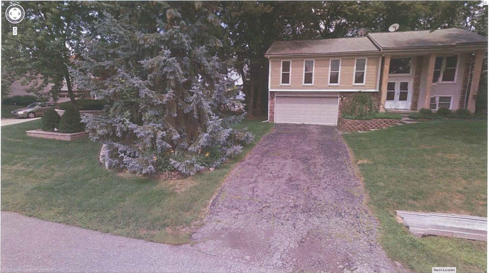
Access to Structure #5