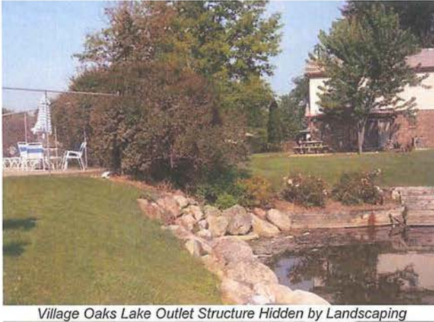
Village Oaks Lake Outlet Structure Hidden by Landscaping

The outlet structure of Village Oaks Lake is located under heavy brush and the pipe is not visible due to a thick layer of stone rip rap. The outlet structure of Village Wood Lake had recently been repaired by the City, and additional rip rap was placed around the structure. The outlet structure and overflow are located in the Village