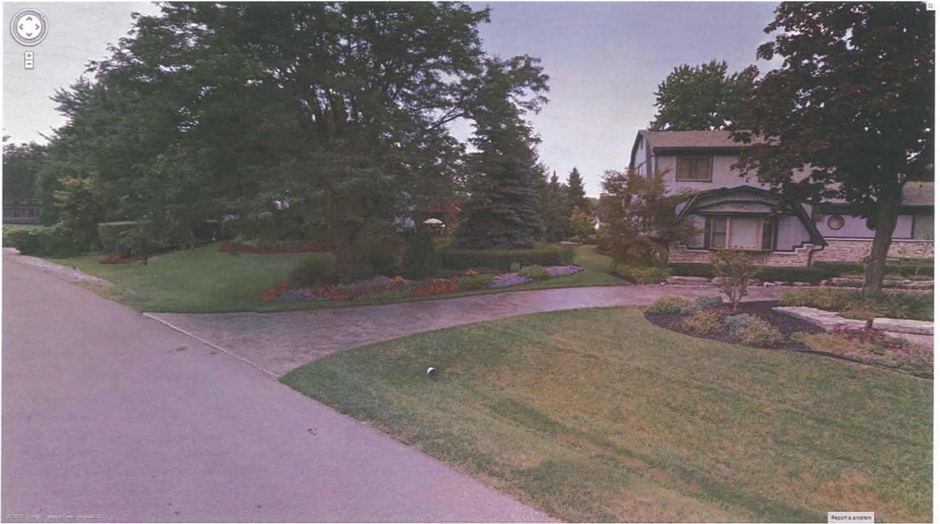
Access to Structure #7