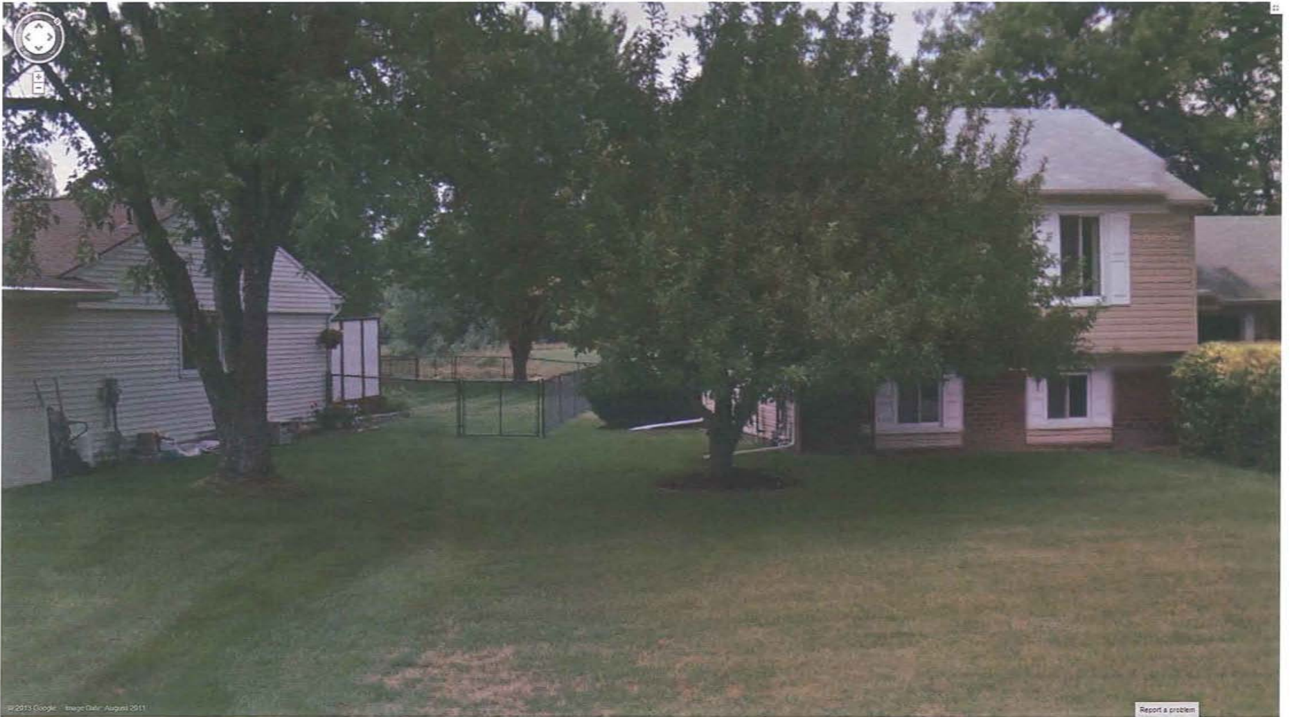
Access to Structure #10