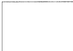
Lake Orion, MI

Sign in with your MLive.com, Facebook or Google account or sign up (https://signup.mlive.com/register?return_to=http%3A%2F%2Fwww.mlive.com%2Fnews%2Fdetroit%2Findex.ssf%2F2011%2F05%2Froyal_oak_gets_thumbs-up_with.html%23comments)