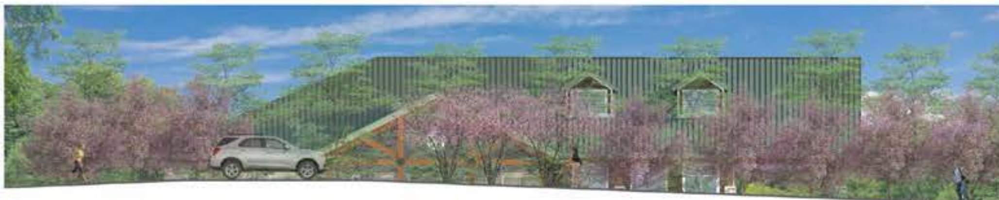
north elevation (view from S. Lake Drive)