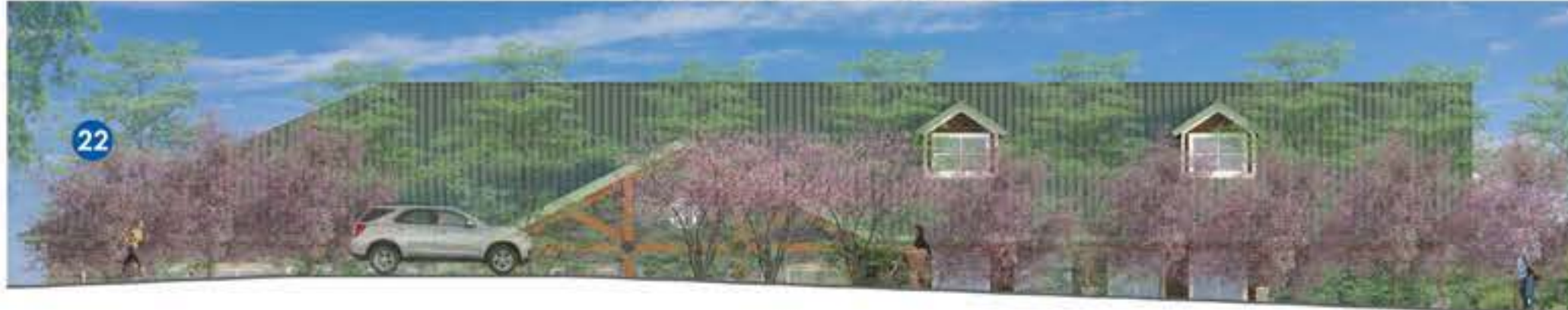
north elevation (view from S. Lake Drive)