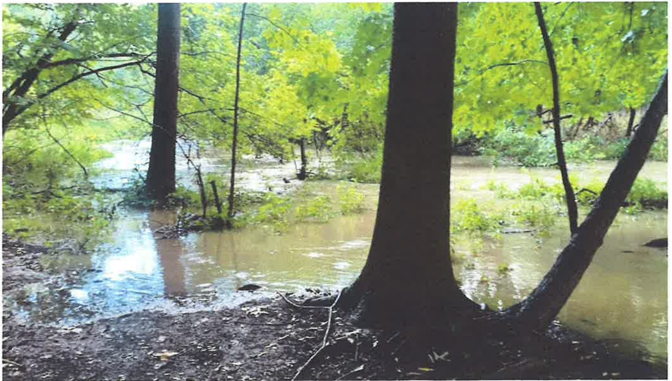
Photo of Chapman Creek flood after one of several severe rainstorms (August 28, 2024)

Ridgeview homeowners have experienced cracked foundations/basement leaks and roof leaks due to the existing high water table within this floodplain zone and the severe rainstorms of the past several years.