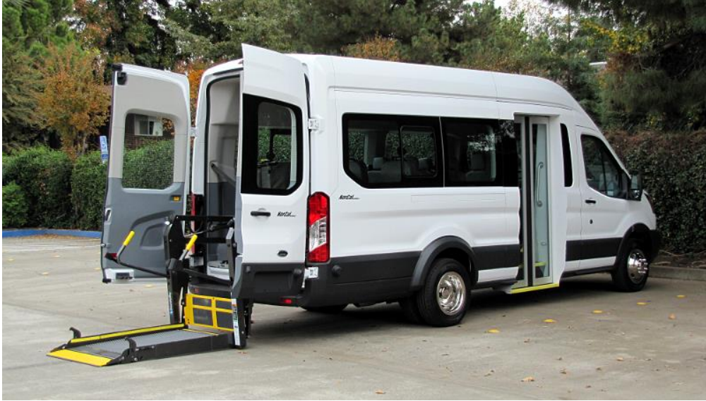
2017 Ford Transit Van