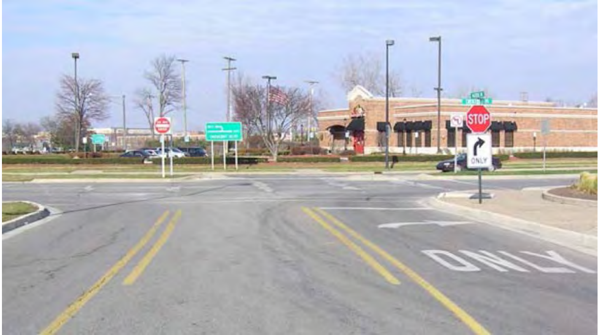
LOOKING NORTHBOUND FROM INGERSOL TOWARD CRESCENT BOULEVARD AT EXISTING SIGNAGE