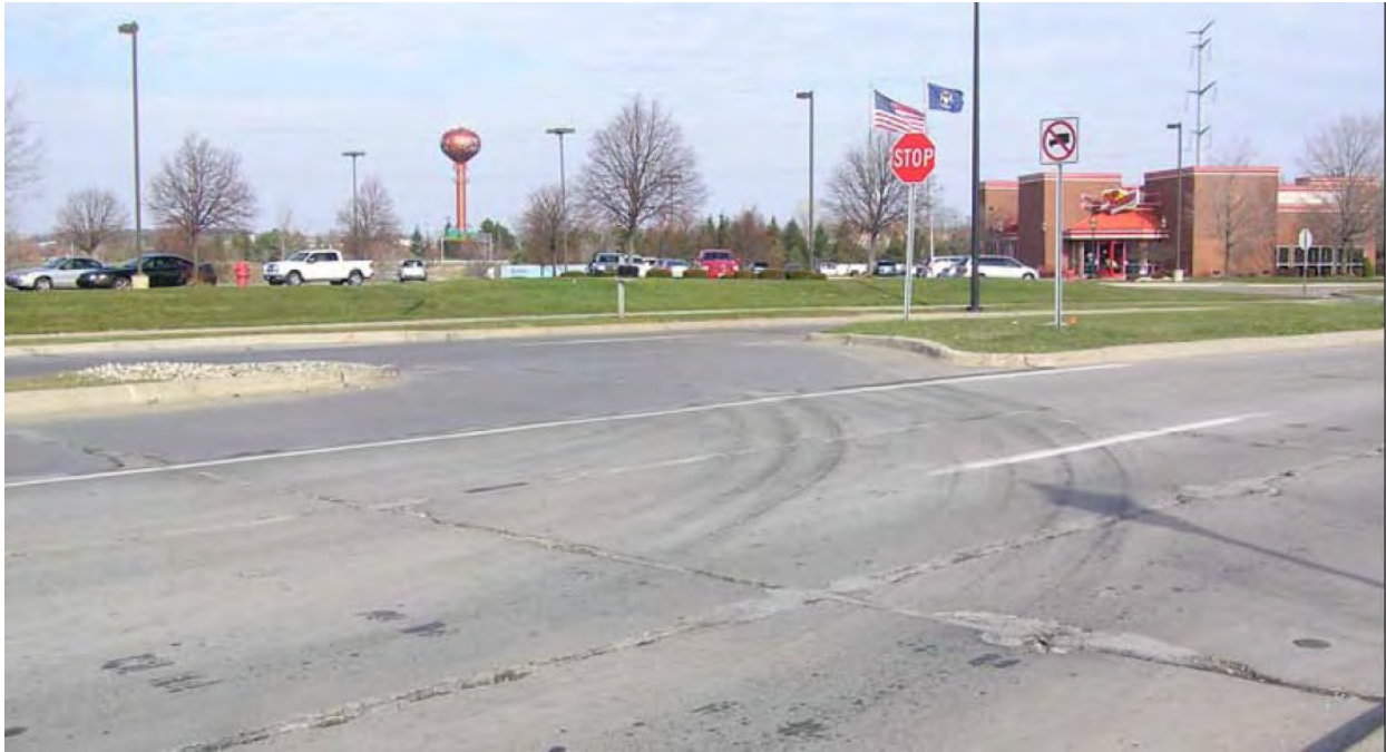
LOOKING FROM THE EASTBOUND LANES OF CRESCENT TOWARD THE EAST-WEST MEDIAN CROSSOVER