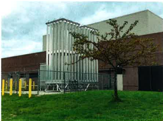
Looking North West from the rear access road, shows the two aerators.

The following images demonstrate the location and surroundings of the tank installation. All are taken from the rear (south side) of the property.