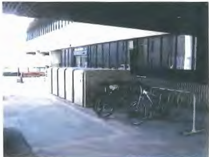
Covered bike parking under roof overhang with bike lockers