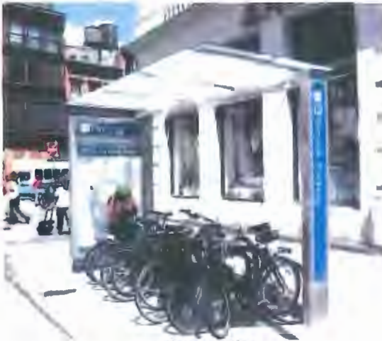
Stand Alone Covered Bike Parking