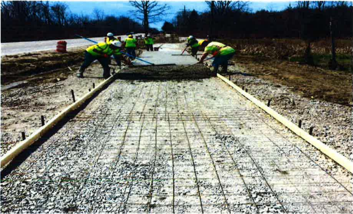
Looking west towards Garfield Road