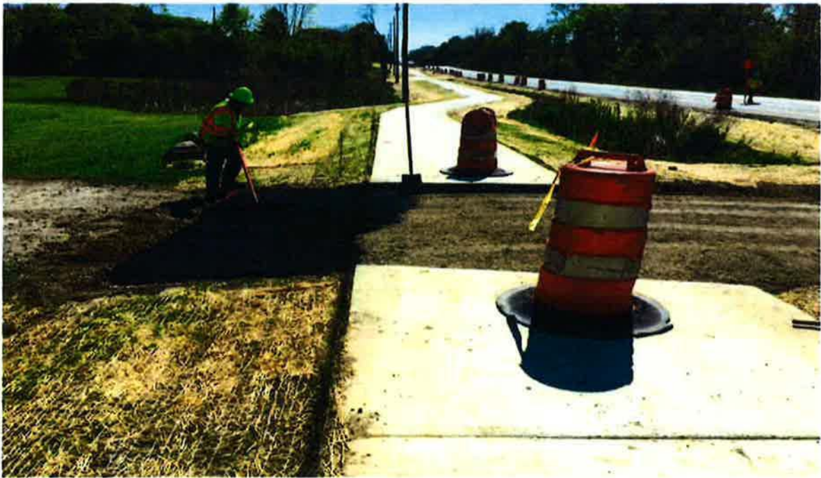
East of Maybury Park Estates, looking east towards Beck Road