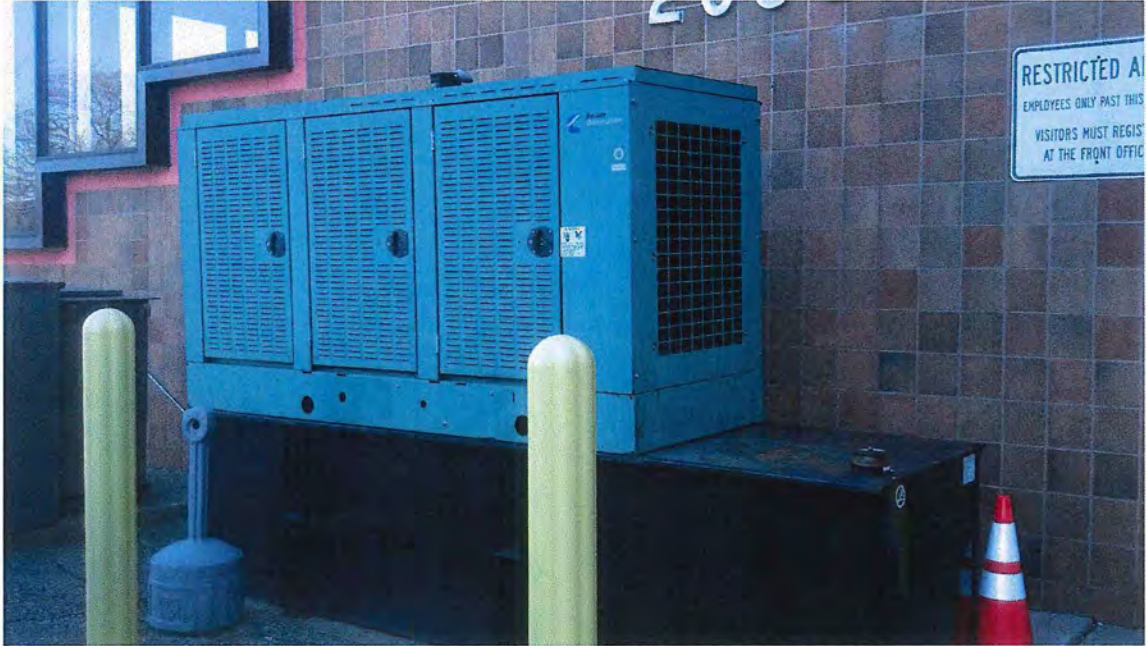
Field Services Complex Emergency Generator