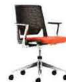
Conference Chair H: 31.9" – 36.9" W: 25.0" D: 26.7" SH: 15.5" – 20.5"