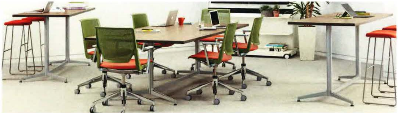
Jive offers a variety of top shapes, bases, and heights to promote various postures through out the work day. The variety allows for integration into any environment. Pictured: Two Jive rectangular 30 x 72 inch tables with a Neo Walnut laminate worksurface and a 36 inch high Metallic Silver base. Jive: rectangular 48 x 96 inch table with a Neo Walnut laminate worksurface and a 29 inch high Metallic Silver base.