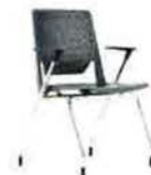
Side Chair H: 33.9" W: 23.5" D: 22.0" SH: 18.2"