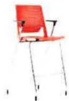
Side Stool – Counter Ht./Bar Ht. H: 42.25"/46.25" W: 23.5" D: 22.0" SH: 25.75"/29.75"