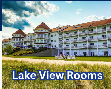
Lake View Rooms