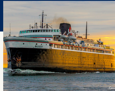
SS Badger Ferry