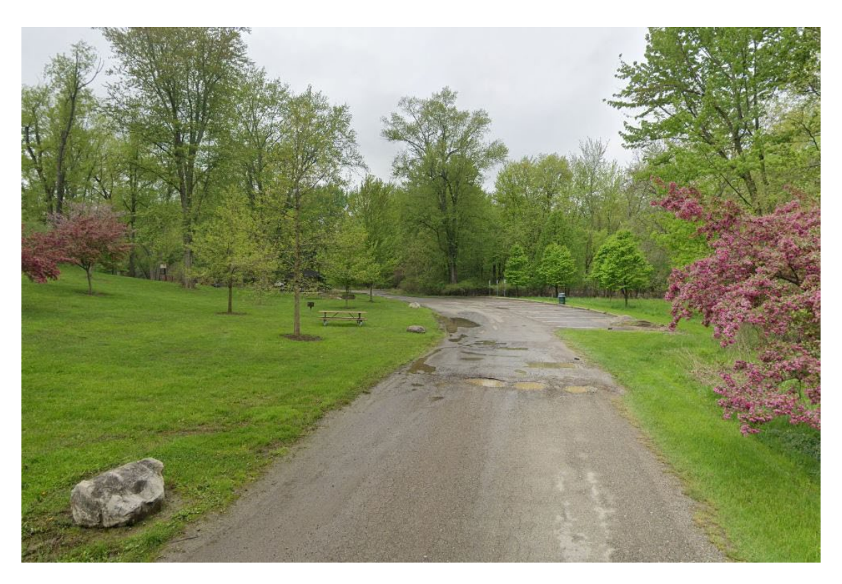
Before – Entrance from existing parking lot, looking south