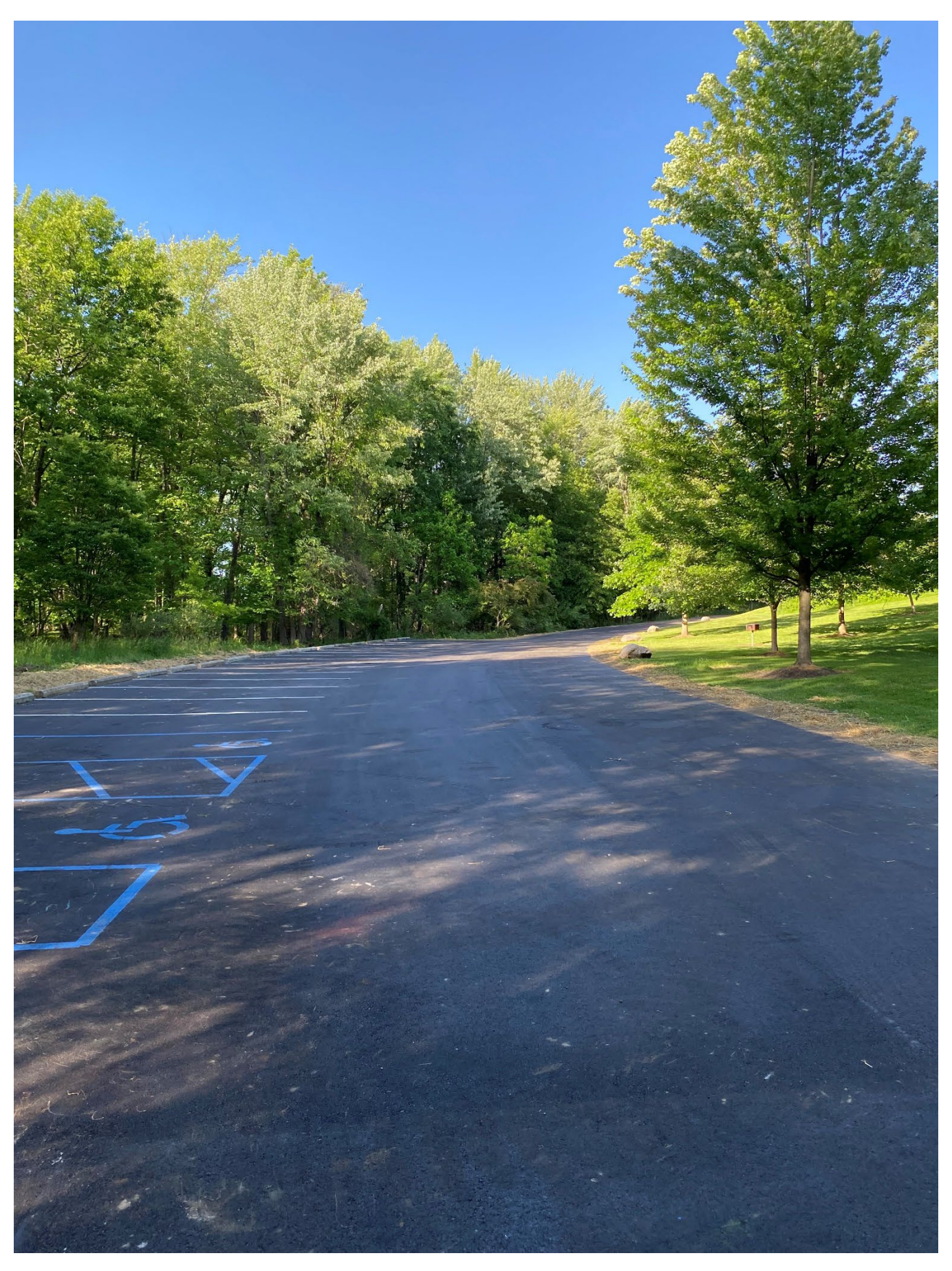
After – New north end of parking lot