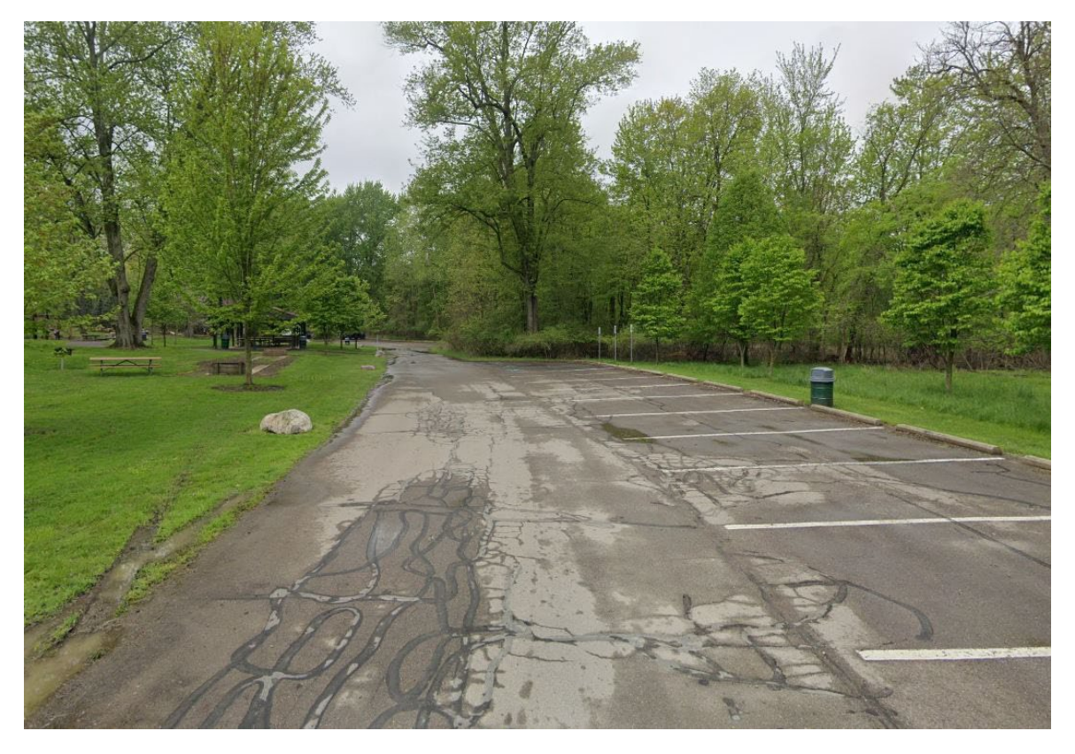
Before – Existing south end of parking lot, looking south