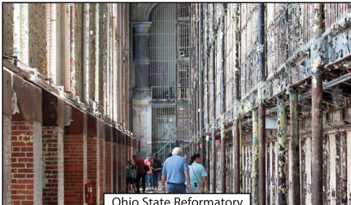
Ohio State Reformatory